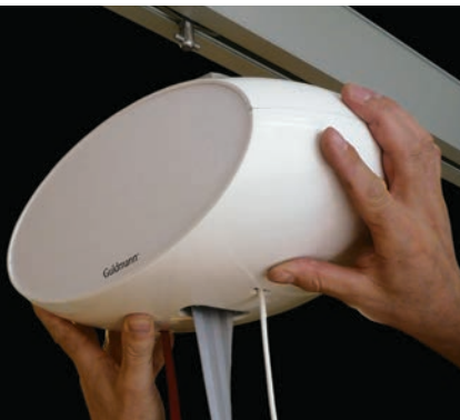
GH1 Q – click-on / click-off version

The GH1 Q lifting module has a quick-release system that makes it very easy to click-on and click-off the lifting module from the rails if it from time to time is necessary to relocate the lifting module to another room or residence. The moving of the lifting module can be accomplished without any use of tools.