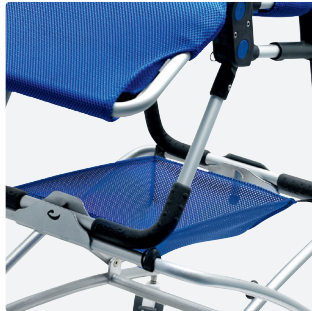
Net for frame One size - 88210x