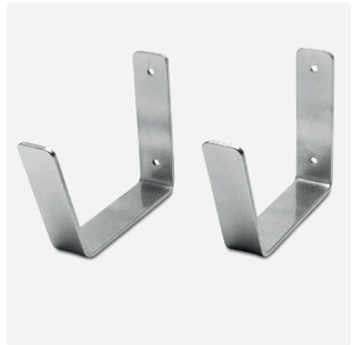
Wall mounting One size - 882110