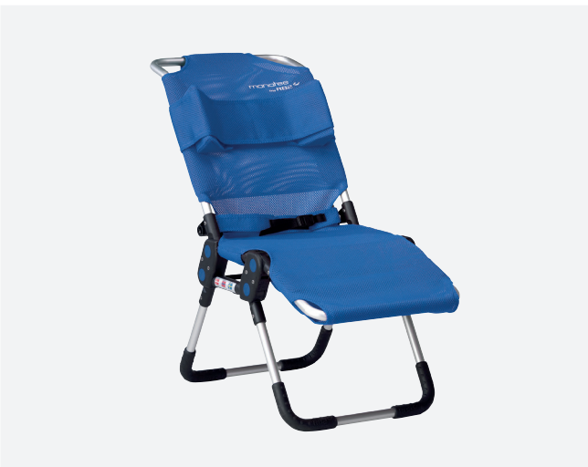
Standard Manatee with head/lateral support and adjustable waist strap