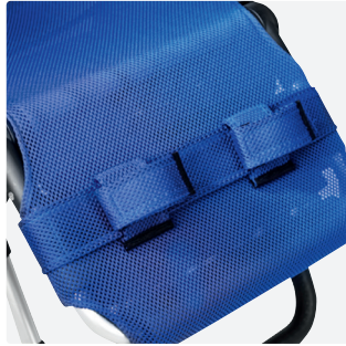
Leg supports Size 0-2 - 88305x Size 3 - 88310x