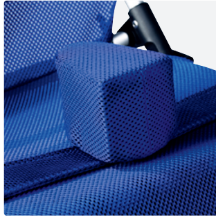
Pommel Size 0-2 - 88304x Size 3 - 88309x