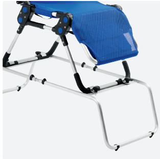
Bath tub frame - basic version One size - 882101