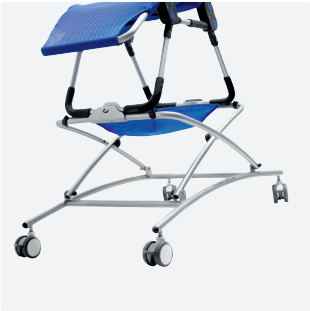
Frame - height adjustable One size - 882100