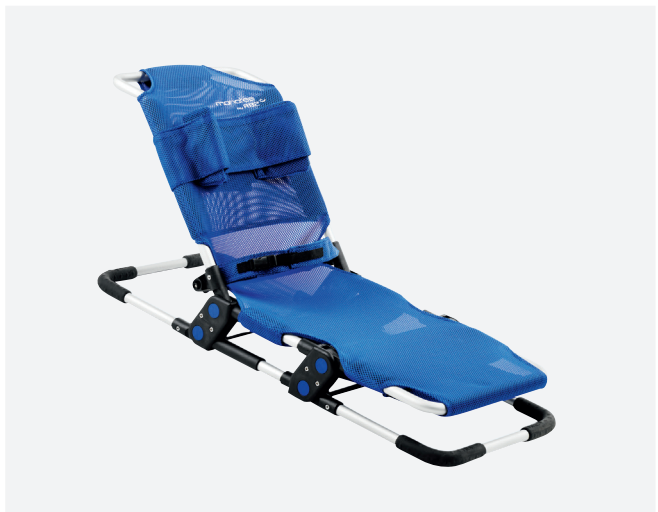
Manatee folded for bathtub use