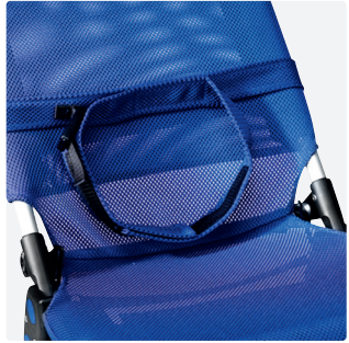
Torso strap Size 0-2 - 88302x Size 3 - 88307x