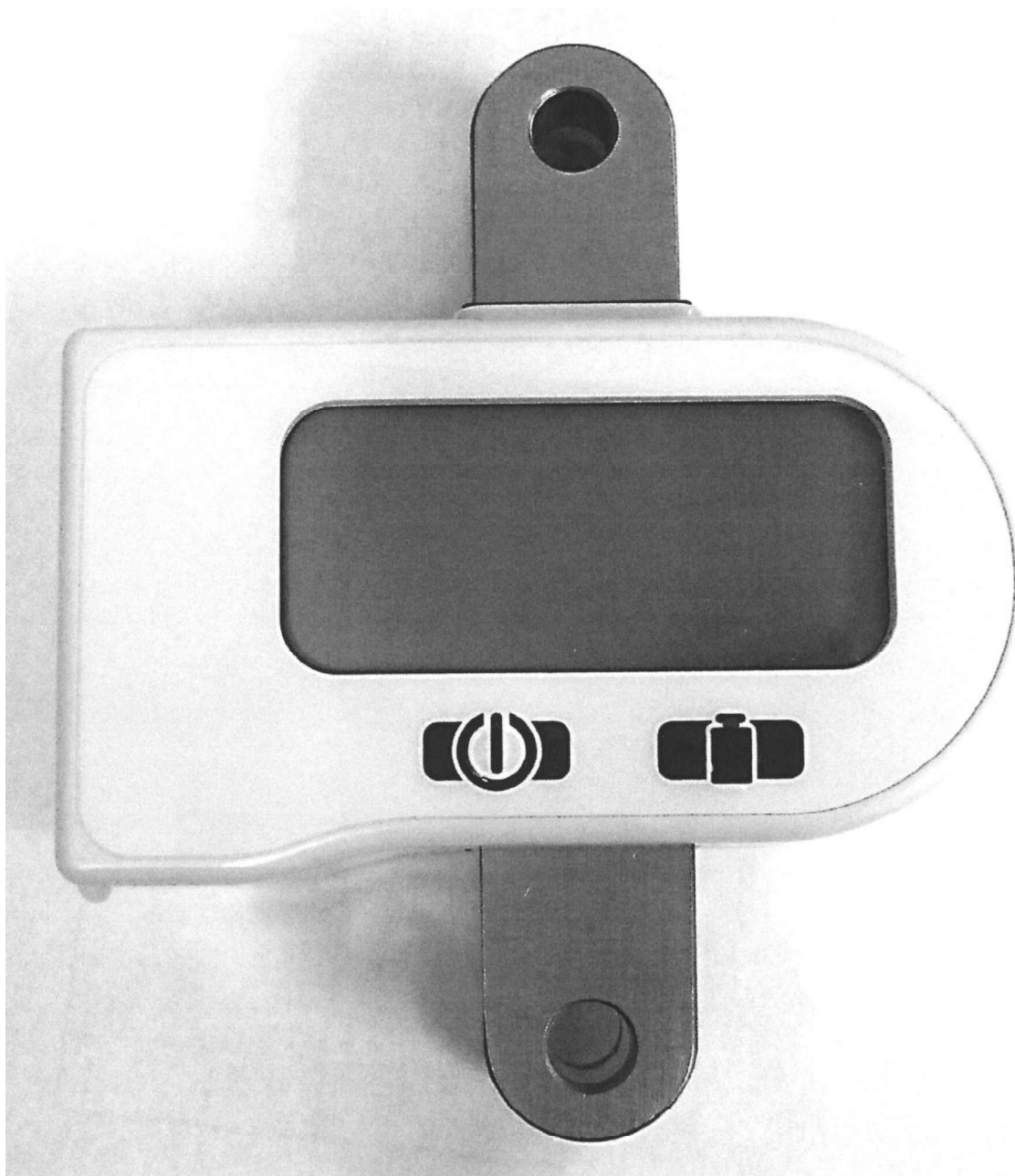
Figure 1 4800MLF / 4800XLF.